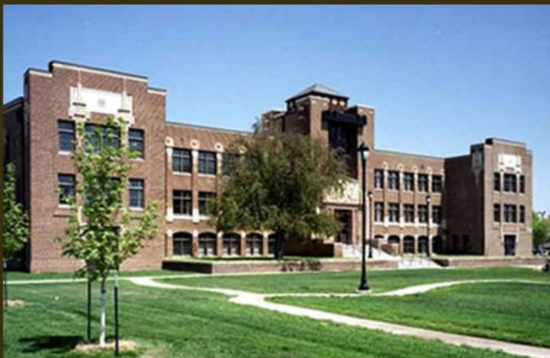
Pioneer Presidents' Place, Salina, Kansas - January 2006

1200 S. Kansas ~ Topeka, Ks 66612-1331 ~ (785) 232-1122